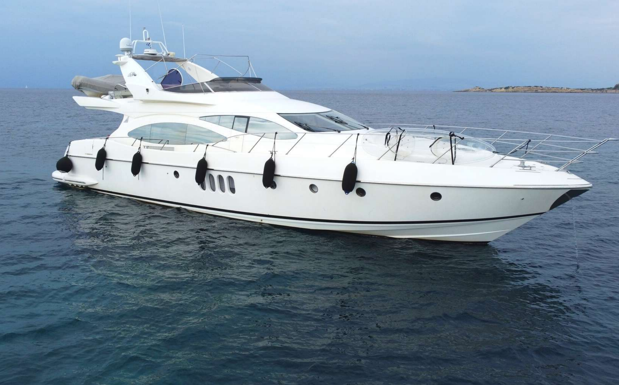
BLUE MED - AZIMUT 68'